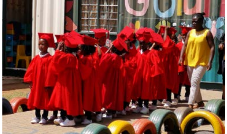
Golang preschool graduation 2018

“ The CHILDREN in the COMMUNITY were offered a PLACE OF SAFETY where they could get a MEAL, PLAY games and LEARN a little more about God. ”