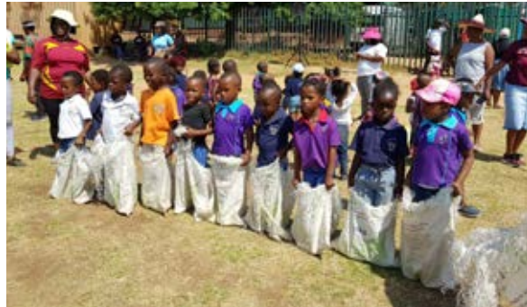
Another wonderful day hosting seven preschools at our Annual Preschool Sports' Day held at Emthonjeni Image below: Sports' Day - receiving our trophies in the new hall