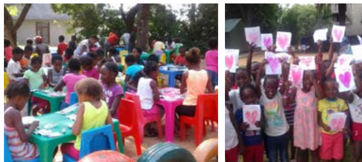
Left: Golang activities 2019, right: Golang aftercare St Valentine's Day

Initially, the children in the community were offered a place of safety where they could get a meal, play games and learn a little more about God. Over the years, this venture developed to what we have today.