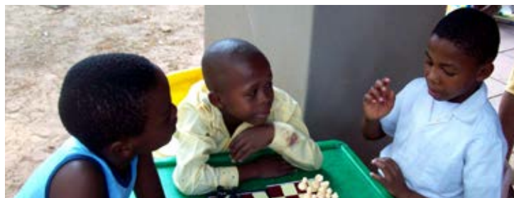
Golang playing chess