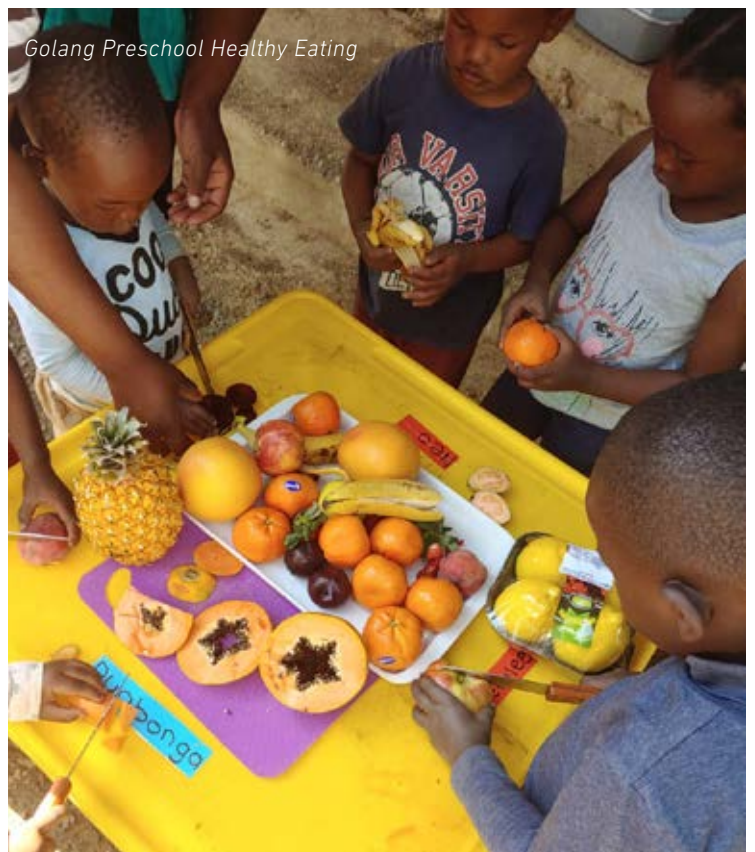
Golang Preschool Healthy Eating

Our registered Preschool was opened in 2008 under the Play-with-a-Purpose franchise, with one group of 20 children. Realising the importance of early childhood education, this has since grown into three classrooms (Grades RRR, RR and R), housing 60 children in converted containers, taught by qualified teachers.