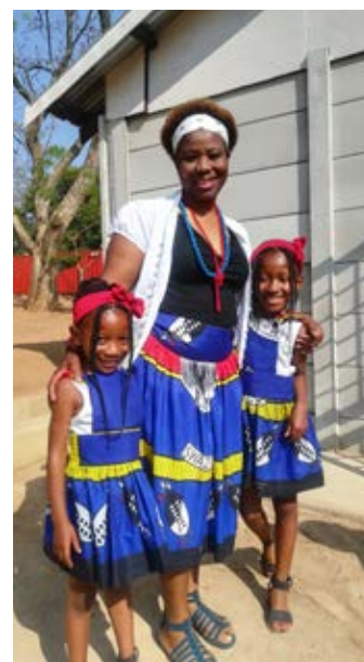
Above and left: Heritage Day Golang 2019; below: Grandparents' Day