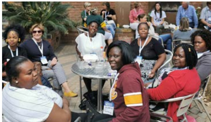
Golang Staff attending Global Leadership Summit

Our work with the children of Golang is accomplished with the support of our Board Members, Management Team, Staff Members, Volunteers, and of course, our Sponsors and Donors, who together ensure that classrooms, kitchens, toilets, playground equipment, soccer field, netball court and the new hall are available for the children's benefit. Our grateful thanks goes to all those involved, and to God, on whom we depend to continue this wonderful undertaking.