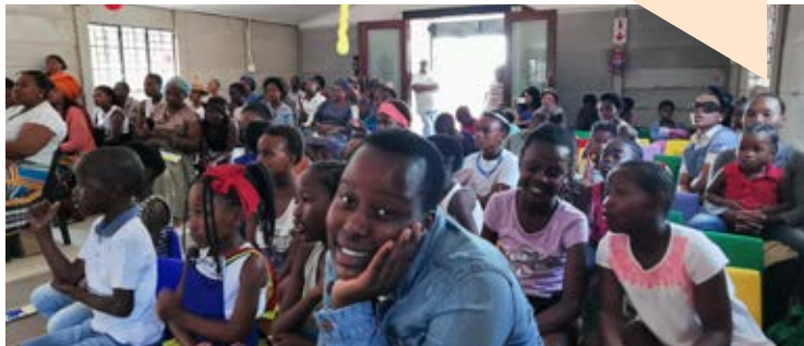
Enjoying the concert in our brand new hall

What began in 2002 as a small venture, with around 50 children from the Informal Settlement in Zandspruit, Honeydew, has now grown to a fully compliant Preschool and Aftercare Centre .