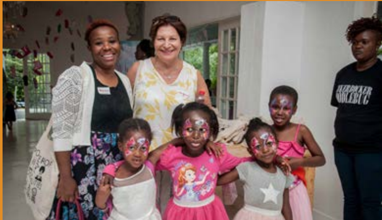
Barbie birthday party - Golang aftercare