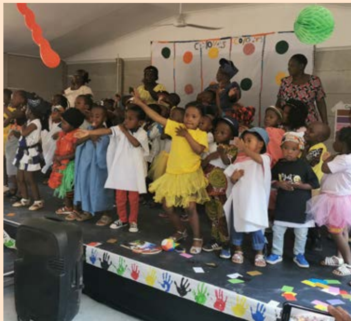
Golang new hall Preschool concert

“ ...by HELPING them DEVELOP MENTALLY, PHYSICALLY, EMOTIONALLY, SOCIALY and SPIRITUALLY. ”