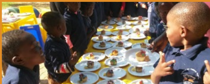
Decorating their fish cupcakes - very proud

A Fish Cupcake Day was enjoyed where the children decorated their own cupcake with icing, jelly tots, cherries, and orange quarters for tails, to look like colourful fish. This activity tied in with the week's programme of Under the Sea. At the Nelson Mandela centenary birthday celebrations, the children had a lovely morning singing songs. A number of organisations paid the Pre-school a visit, providing everyone with blankets, cake, toys and an awareness discussion around safety with electrical items.