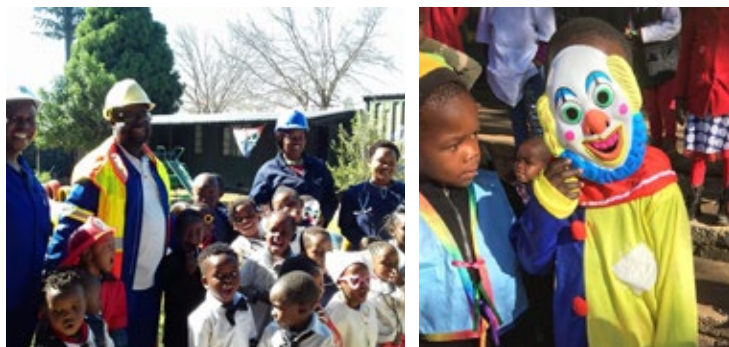
Career Day - what will I be?

We had a geologist and a nurse give talks, while the children dressed in uniforms for their preferred careers. A fun day was had finding out what career each child wishes to follow.