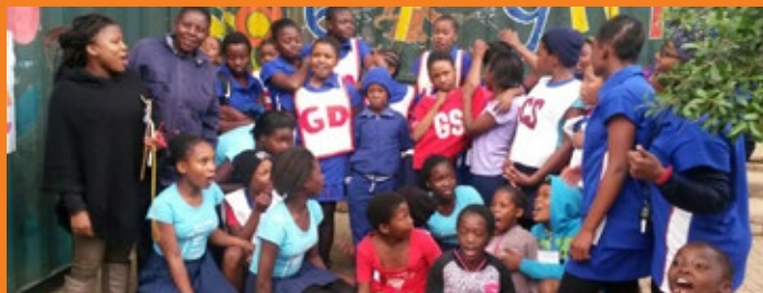
Our netball teams are winners!