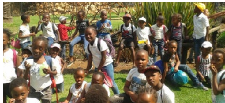
Fun at the zoo

stations were set up which included various activities, and children moved from one station to the next, enjoying the particular activity at each station. All staff were in attendance, with assistance from Siyakholwa students and our Youth, who had completed their Holiday Club Training at Community Ministeries, thanks to Pastor Sam.